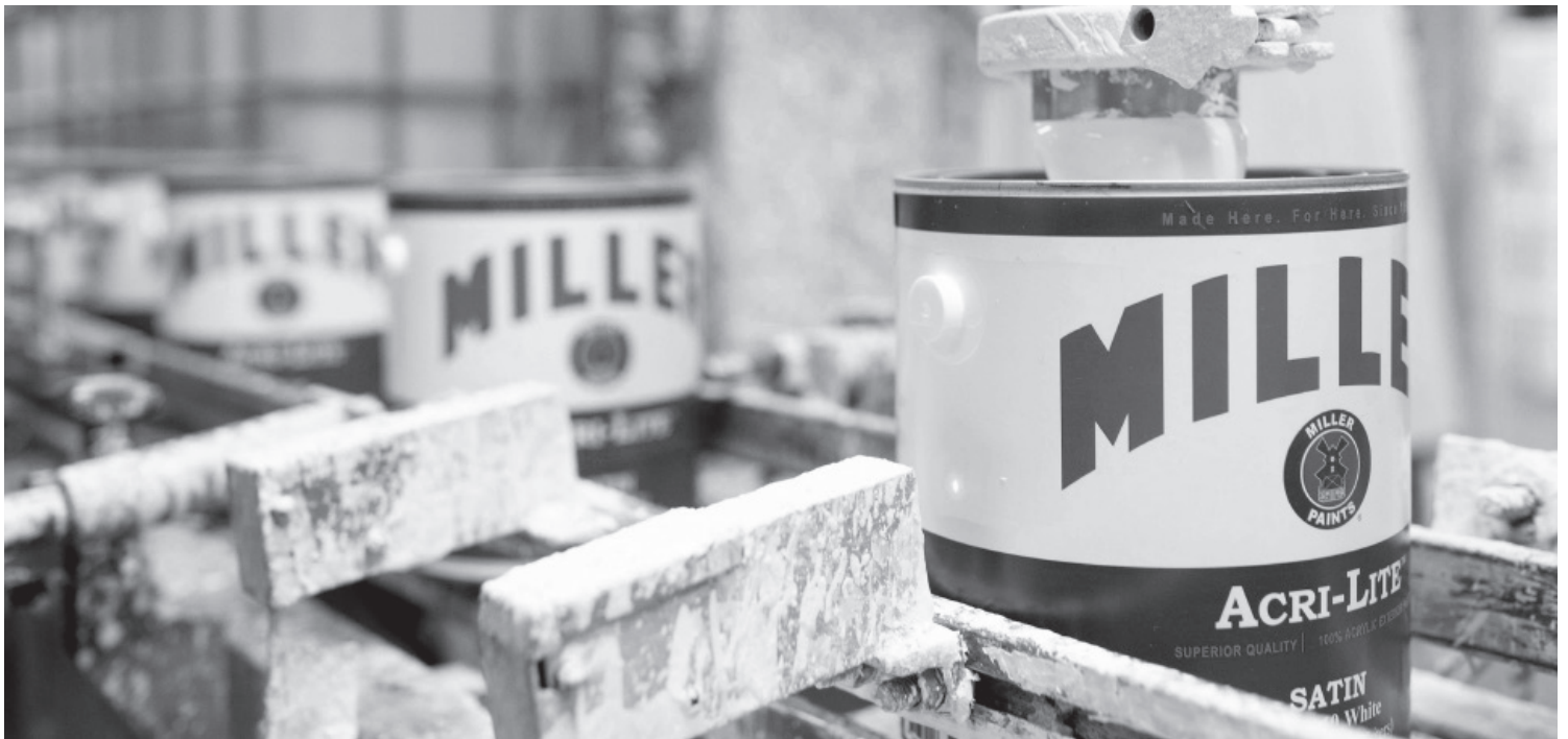
ACRI-LITE coming off the line at our factory in Portland, Oregon